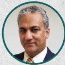
MR. AJIT PAI

James L. Frank Professor of Accounting, Economics, & Finance Yale School of Management